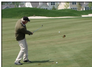
What a swing!

The Delaware Conservation District Employees Association held a joint spring meeting with the SWCS Pocomoke Chapter. Attendees toured the Great Cypress Swamp located near Dagsboro, DE. The tour featured wetland restoration and sustainable forestry practices implemented by Delaware Wild Lands, Inc. and their partners. DCDEA held its annual golf tournament in April. There were 39 golfers at the tournament. Total net proceeds were $1044.04 with a portion of those going towards the newly established DCDEA Scholarship Fund. This